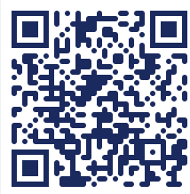
X / Twitter